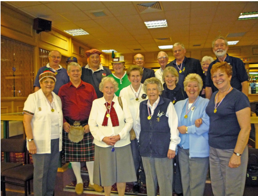
Victorious Scottish team and best dressed interlopers from Wales and Ireland