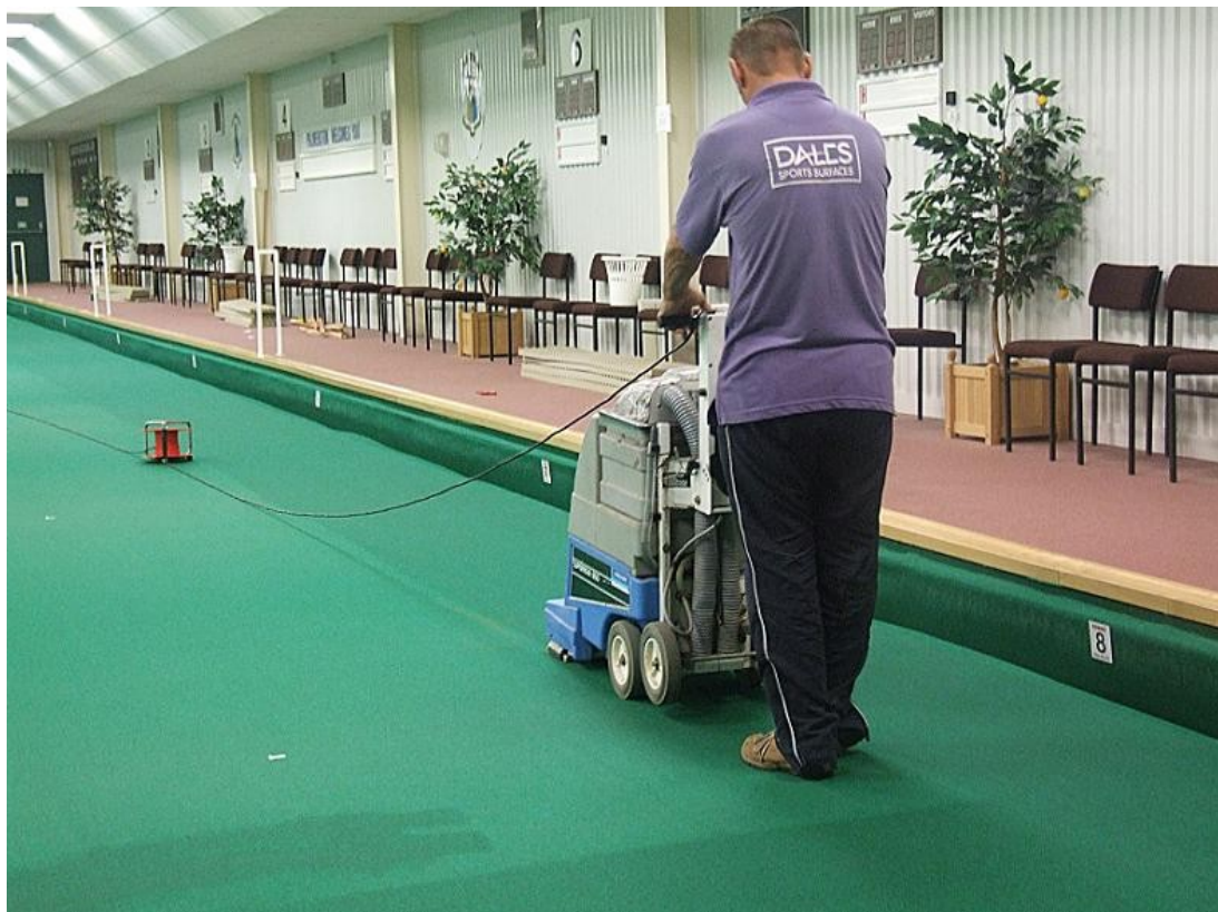
The clean up

A scientific approach is used to reverse the carpet - holding on to the corners, they count to three and run like hell to the other end of the rink