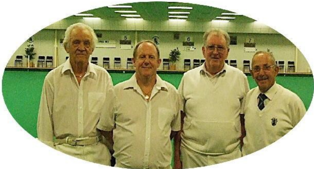
FIRST WINNERS - FINALISTS